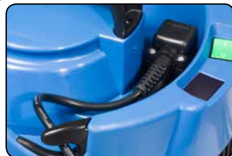
Numatic high efficiency longlife motor