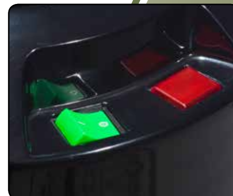
On / Off power indicator