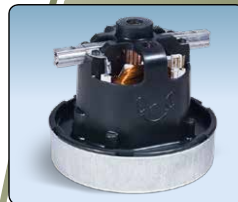
Numatic high efficiency 420W longlife motor