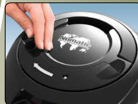
12.5m Cable rewind storage system