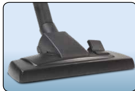
ProFlo high efficiency combination floor tool