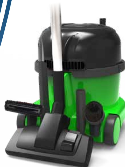
On-board tool storage and wand docking

How green is your clean? NuSave provides true Eco "A Plus" economy with 420W longlife performance.